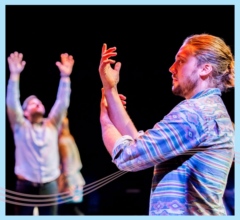
Image: Contemporary Indigenous Theatre Teacher Professional Learning, Bunjil Place Studio, 2023.