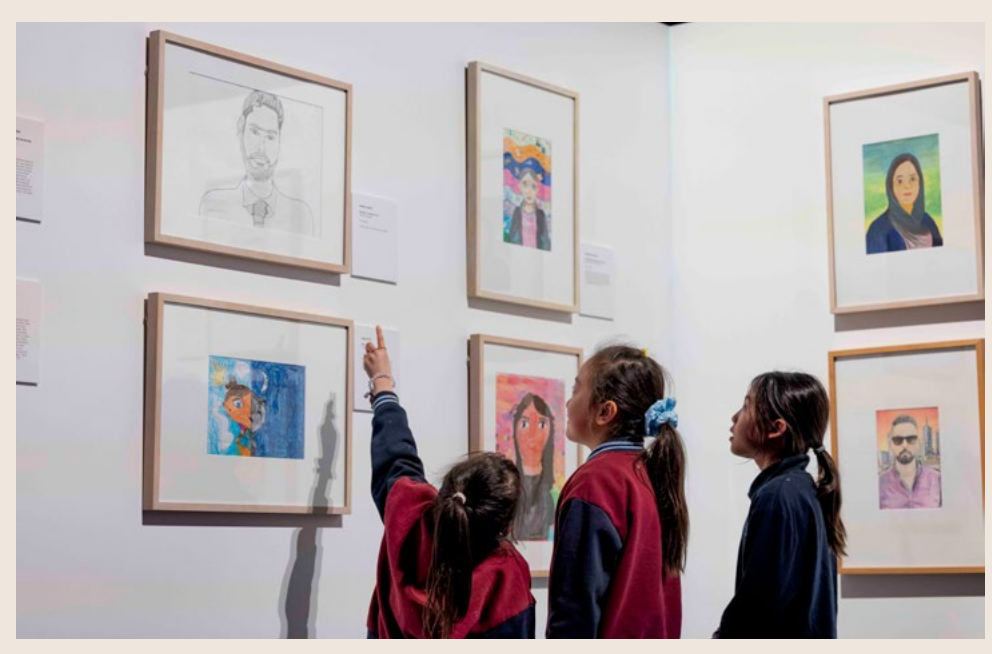
Image: Installation view, 'Young Archie Narre Warren', Bunjil Place Studio, 3 September - 14 October 2024.