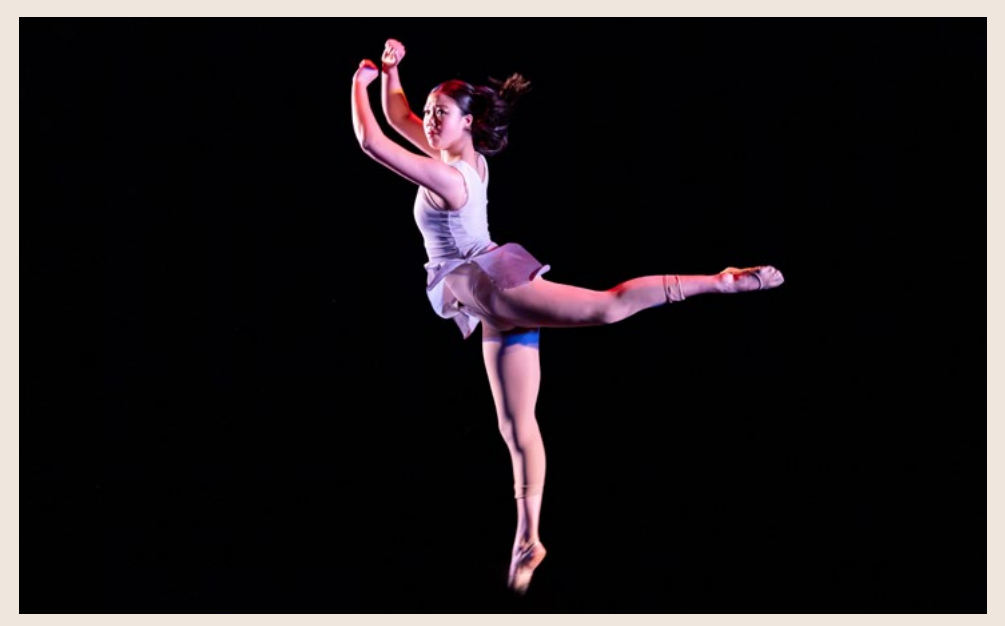
Emergent 2023: Graduate Showcase, Sunday 17 March 2024, Bunjil Place Theatre.

The City of Casey Council acknowledges the support of the Department of Education, Victoria, through the Strategic Partnerships Program.